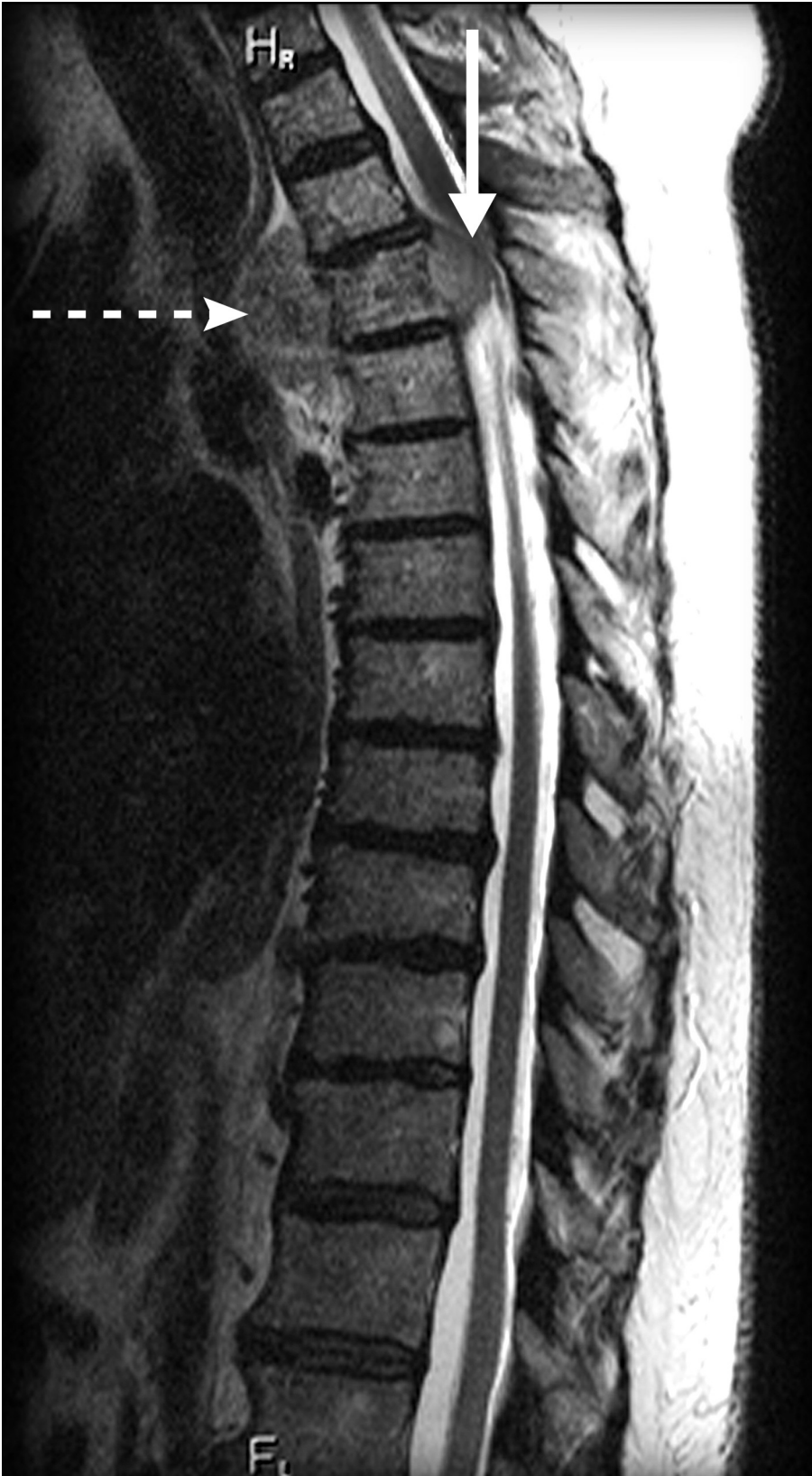
Fig 3 Sagittal T2 weighted magnetic resonance image of the thoracic spine showing a tumour mass in the upper thoracic spinal canal (solid arrow) and in the prevertebral region just in front of the spine (dashed arrow). The spinal canal component is causing compression of the underlying spinal cord.